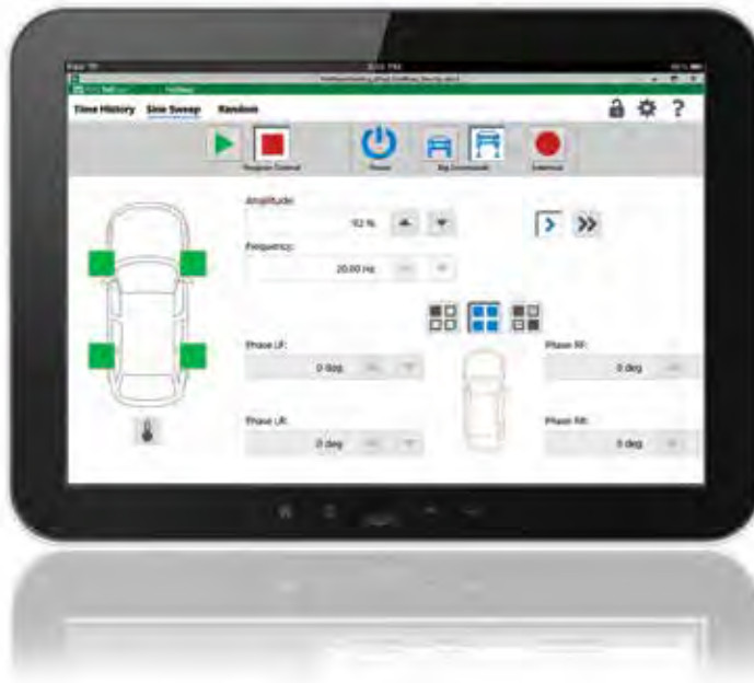
Compact Touch-screen Tablet

A single press of a button on the tablet also allows you to provide or remove power from any set of actuators and automatically bring the actuators to ride height. This is only the beginning of the functionality you can control from this compact, handheld tablet.