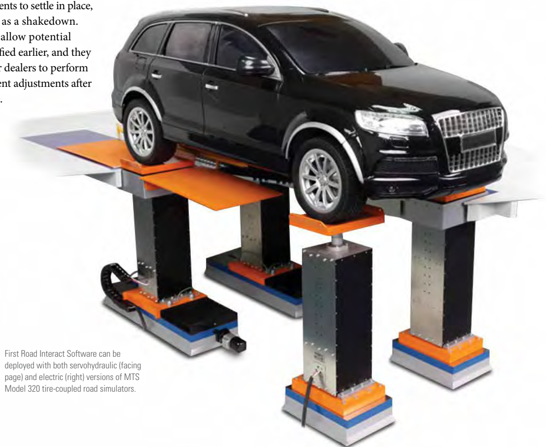
First Road Interact Software can be deployed with both servohydraulic (facing page) and electric (right) versions of MTS Model 320 tire-coupled road simulators.

Although offline systems typically require more sophisticated tools, the convenient MTS First Road Interact Software and tablet interface makes system activation easy. The user interacts with one of three displays on a compact touch-screen tablet, arranged so that you can precisely control sine wave tests, random waveform tests or exact road surface simulations. Simply drive the vehicle onto the wheel pans and select a button on the touch-screen interface to subject the vehicle to your choice of simulation profiles.